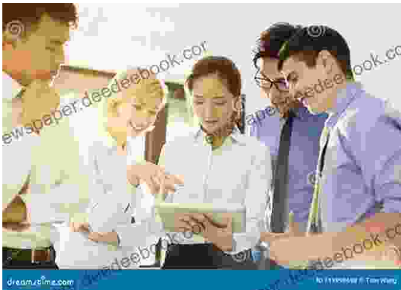
Image Caption: A team of entrepreneurs and investors discussing a business plan. Minority investments and buyouts can bring together entrepreneurs and investors with complementary skills and resources.

growth aspirations. By understanding the key aspects, benefits, and considerations involved, businesses can make informed decisions and maximize the benefits of these partnerships. This comprehensive guide provides a roadmap for navigating the complexities of working with private equity and venture capital firms, empowering readers to achieve successful outcomes.