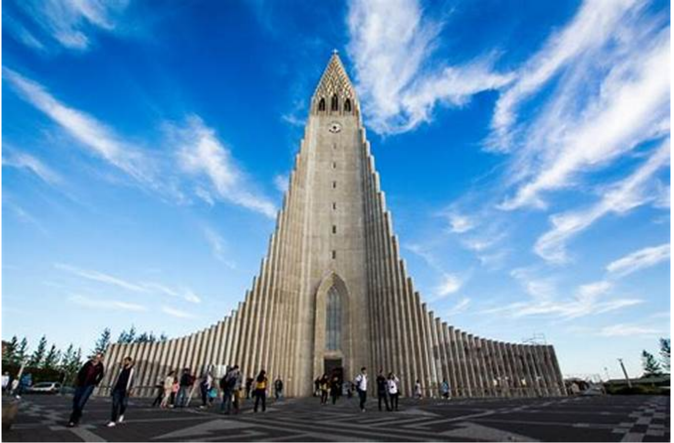
The vibrant energy of Reykjavik, Iceland's capital