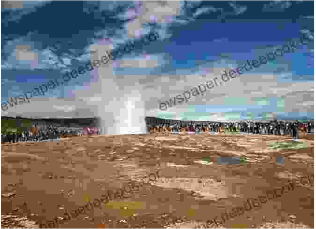
Witnessing the geothermal wonders of the Golden Circle