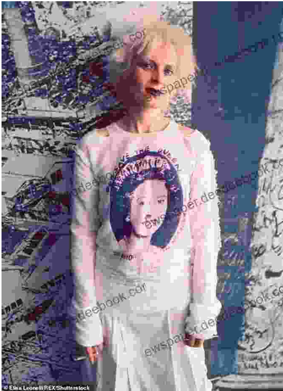
Vivienne Westwood with the Sex Pistols in the 1970s.

In the mid-1970s, Westwood became closely associated with the punk rock band the Sex Pistols. She designed the band's iconic clothing, which featured safety pins, bondage gear, and other provocative elements. Westwood's designs helped to define the punk aesthetic and became synonymous with the movement's rebellious spirit.