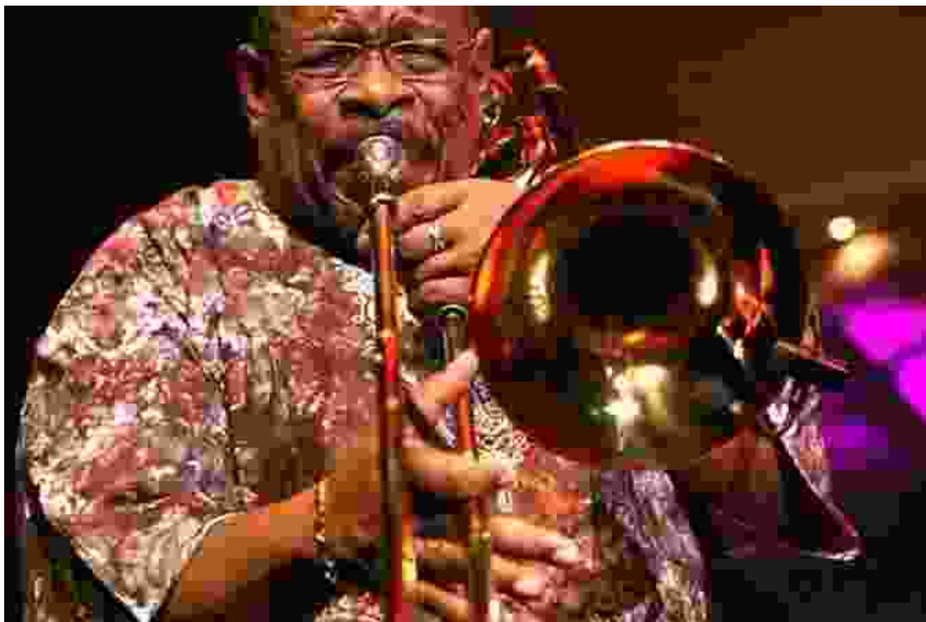
Fred Wesley performing with Parliament-Funkadelic

In the late 1960s, Wesley left James Brown's band to join George Clinton's Parliament-Funkadelic collective. Clinton's music was even more experimental than Brown's, and Wesley quickly embraced the freedom to explore new sounds and styles.