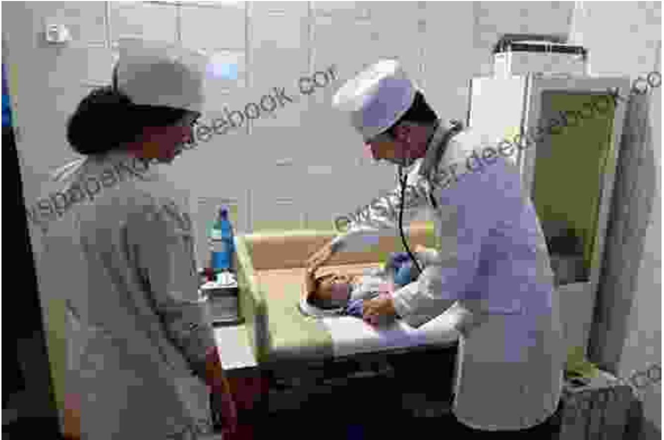
Well-Equipped Hospital in Argentina