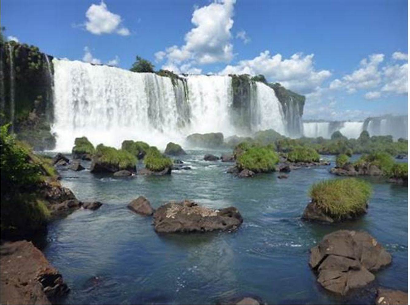
Breathtaking Iguazú Falls