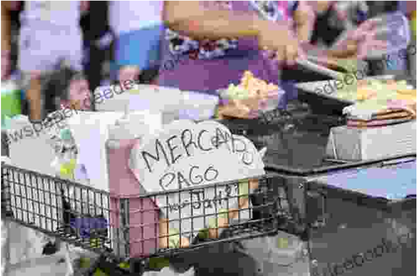
Street Food Stall in Buenos Aires