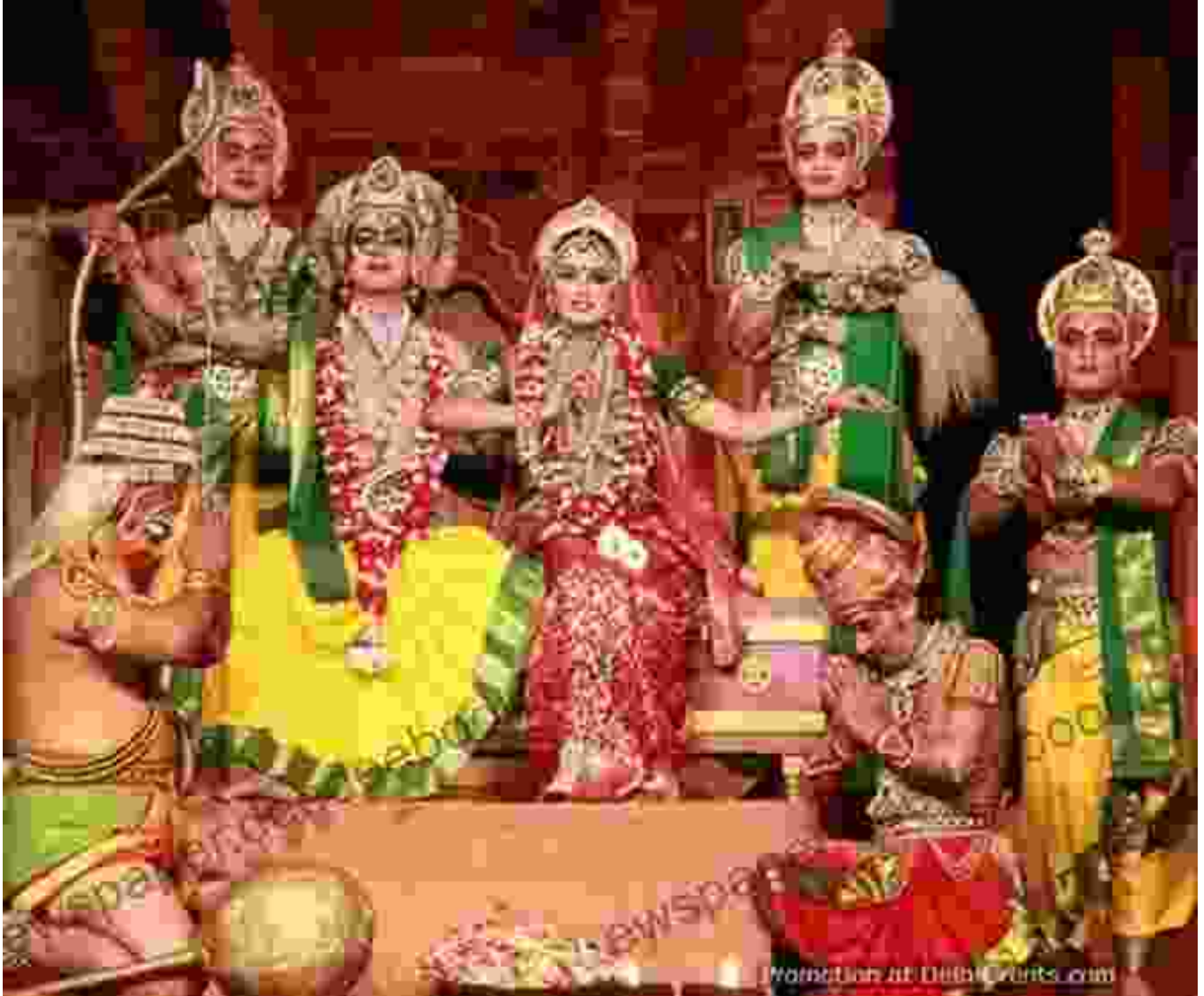
A Shri Ramlila play being performed in India